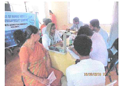
Pulmonary Medicine outreach camp